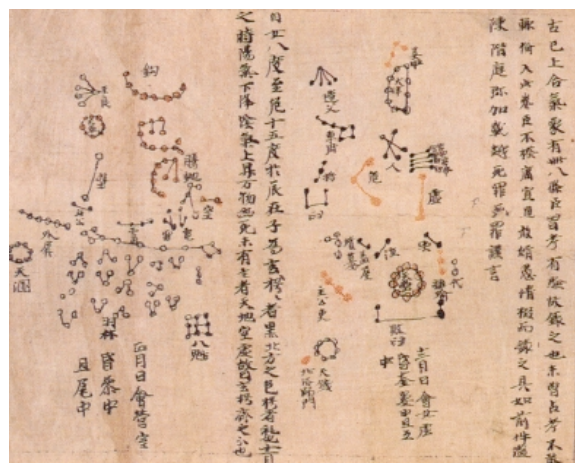
Fig.6 Star Chart, c. AD 940, in the Dunhuang collection in the British Library.

This paper has set out some of the issues we have to consider in preserving digital objects. With cooperation and effort, we can hope to keep wonderful things like the new interactive star maps that Kim Veltman describes, alongside the thousand year old Star Chart, the oldest manuscript star chart in the world.