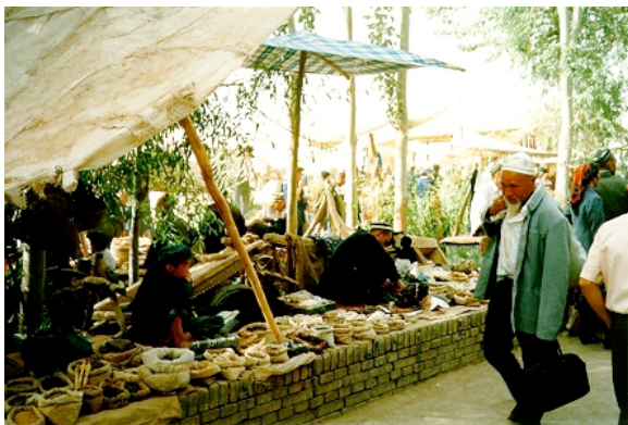
Fig.5 The sunday market in Kashgar.

What's to stop someone creating or altering a digital cultural object and claiming that it is original and unique? What's to stop them creating a saleable 'new' digital collection, claiming that the real objects have been destroyed? As long ago as 1995 it was said in the Wall Street Journal that digital images constituted the largest art market in Europe.