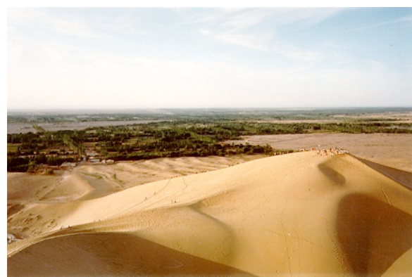
Fig.4 The singing sands on the edge of Mingshashan.

Searching for an image in a large collection of digital files could be like searching for a grain of sand in a sand dune.