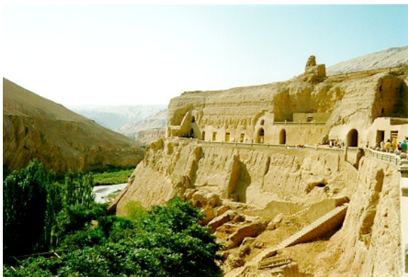
Fig.2 The Bezeklik Grottoes in the Flaming Mountains near Turfan.

All four of the issues that are important for the survival of actual objects are obviously relevant to digital ones. They certainly illustrate some of the difficulties. Digital objects do not have a physical existence, of course, but they have to reside on physical media. Electronic chips and magnetic and