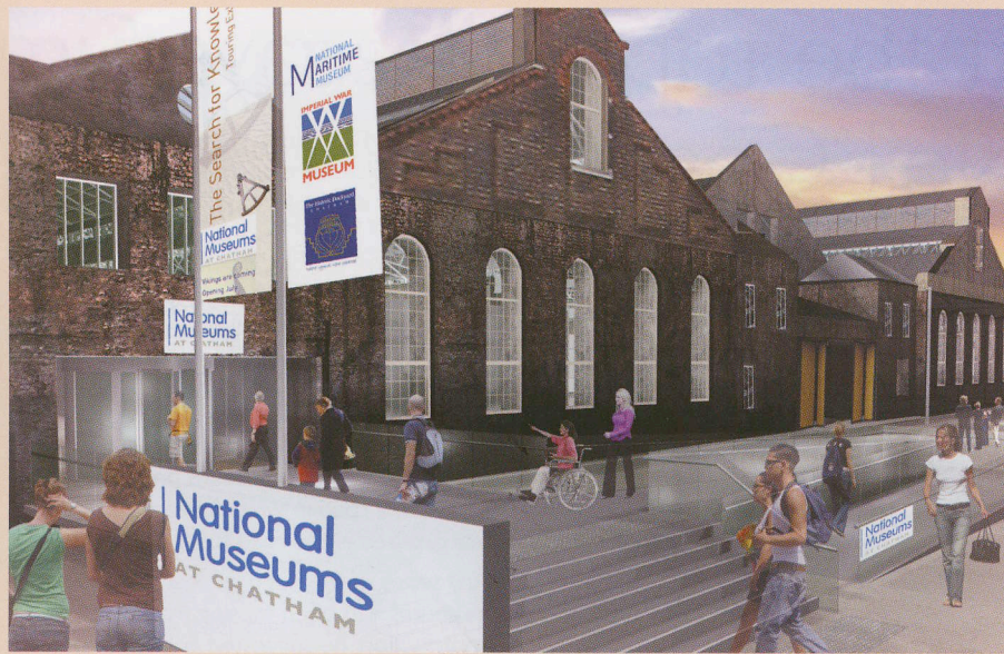
National Museums at Chatham is a project specifically aimed at utilising stored collections. In a partnership with the National Maritime Museum and the Imperial War Museum the project will house and display the national museum partners' maritime model collections within No. 1 Smithery, a Scheduled Ancient Monument.

access, rather than only, or mainly, for individuals: group access is more access.